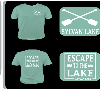
Design C (front left)